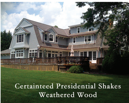
Certainteed Presidential Shakes Weathered Wood