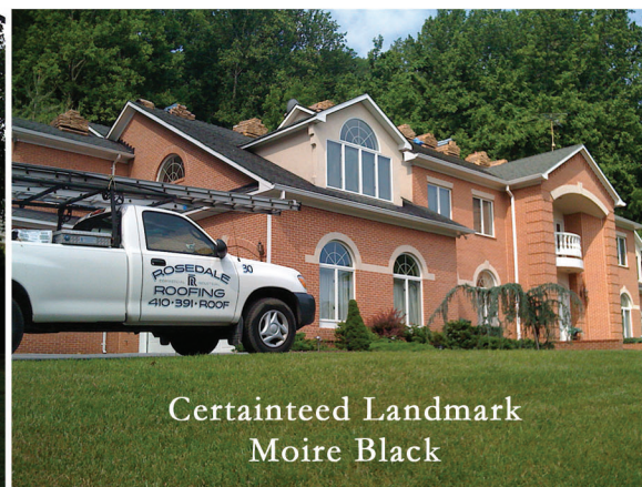
Certainteed Landmark Moire Black